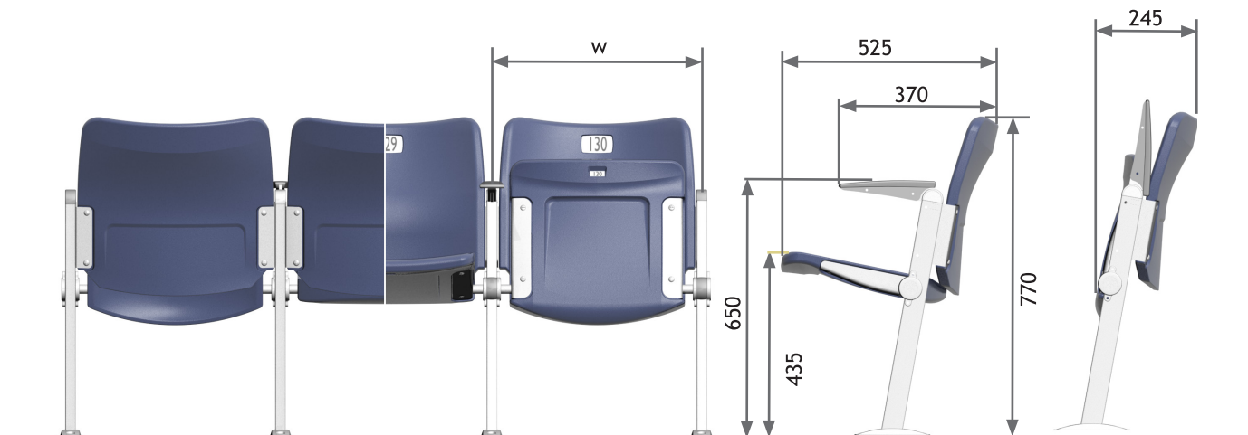
Drawing shows tread fixed chair. Height measurements are taken at seat centre. All dimensions are nominal.