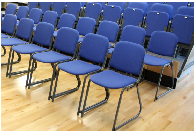
Designed to complement other seating. Note: Standard steelwork color is black.