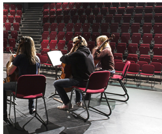
Flexible occasional seating