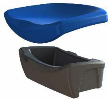
Upper and lower sections of the seat

Blow moulded double skinned high density polyethylene, contoured for comfort and finished in a choice of 15 colours. The lower section and upper section of the seat can be finished in different colours if desired.