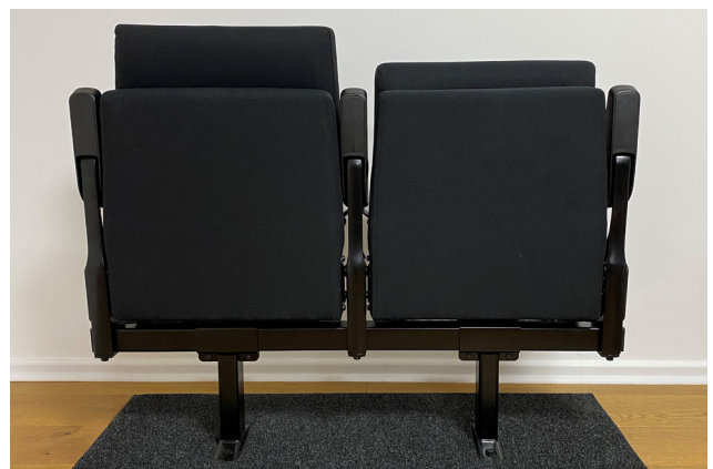
High back and standard back models