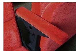
Top: Fold away writing tablet