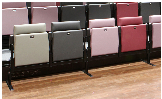
Removable Evolve chairs on our 'Matrix' floorbar system

Options include a sprung seat core for outstanding support and decorative timber panels for the rear and/or under the seat. There is also a choice of three armrest designs, and an optional fold away writing tablet.